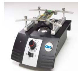
PCT-100 Pre-heater Convection Tool with Int. Board Holder