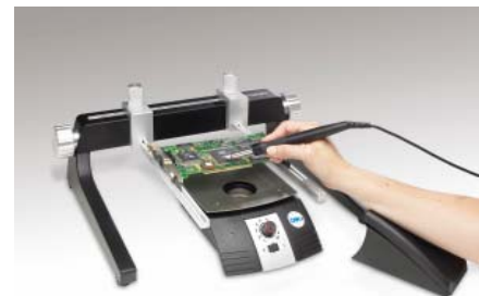
Use OKi or Metcal soldering tools with the PCT-100.