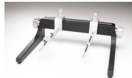
BH-100 Free-Standing Board Holder