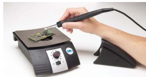
Rework small boards directly on the PCT-100

An Arm Rest is also available to steady your hand and keep your arm from being fatigued. The board holders and arm rest are available as complete kits, with the PCT-100, or they can be purchased separately.