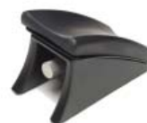
PCT-AR Arm Rest